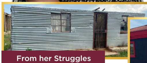
From her Struggles